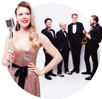
BELLA & THE BOURBON BOYS